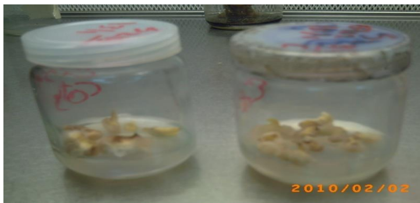
Plate 1: Embryogenic and non embryogenic calluses.