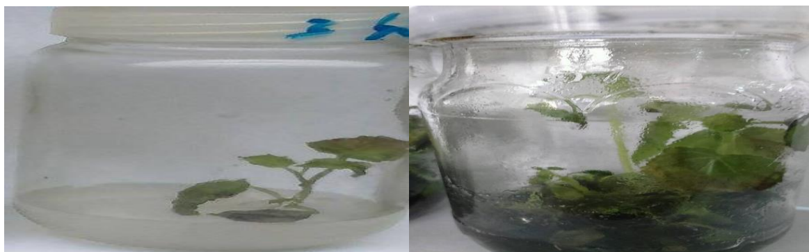
0.5 mg/L GA3 1.0mg/L GA3

Means of different GA3 concentrations followed with the same letter within each column are not significantly different from each other at 1% level.