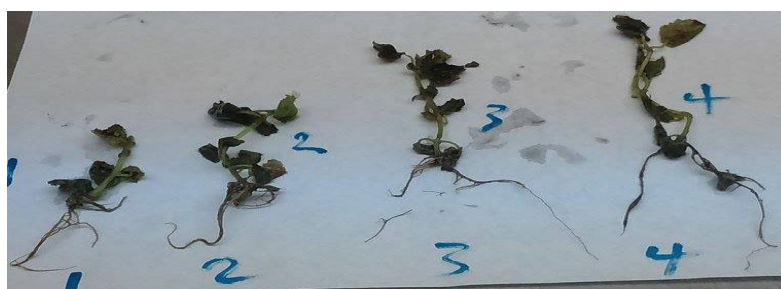
0.0 mg/L IBA 3.0 mg/L IBA 2.0 mg/L IBA 1.0 mg/L IBA