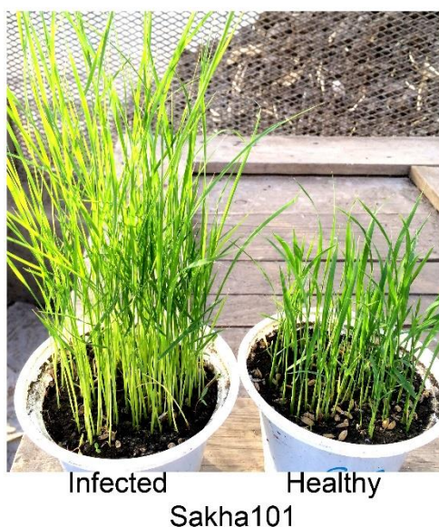
Figure 2: Symptoms of Bakanae disease as abnormal elongation of Sakha 101 seedlings under artificial inoculation.