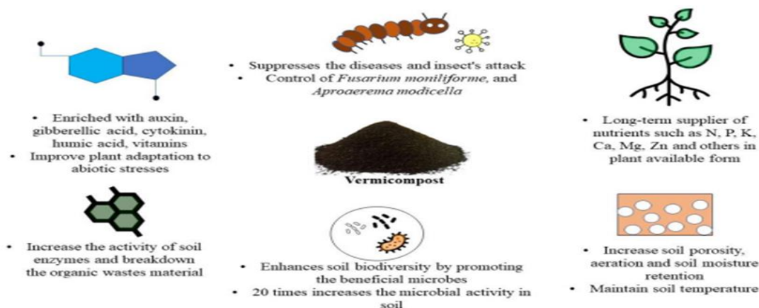
Fig. 2. Vermicompost serves as a plant growth regulator and biocontrol agent, enhancing the physical, biochemical, and fertility properties of soil while suppressing pest attack (Rehman et al., 2023).

Regarding the effects of vermicompost on tomato plants performance, the combination of vermicompost and wastewater is effective in enhancing soil fertility by increasing nutrient availability, microbial activity, and productivity as well as improving quality (Masciandaro et al. 2014 and fig 2). Vermicompost also enriches plant growth and improves microbial activity in the soil, which supports plant growth and enhances photosynthesis (Raza et al. 2024). Similar results were obtained by Alam et al., 2024 indicating that the use of vermicompost and irrigation with wastewater significantly affected tomato plants performance, particularly in terms of growth and yield.